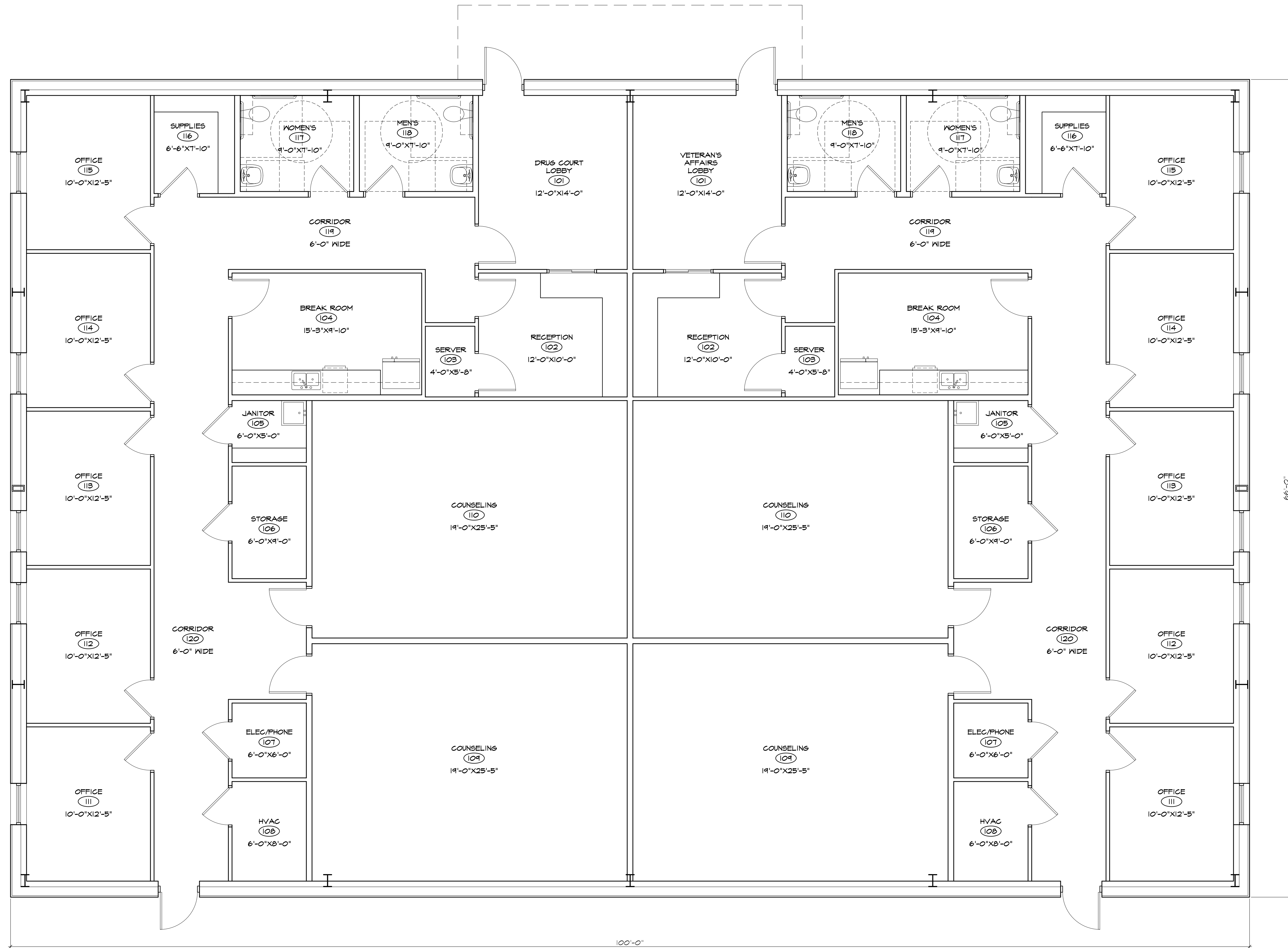
PROPOSED FLOOR PLAN SCALE: 1/4"=1'-0" SQUARE FOOTAGE: 6,600 SF

Timothy M. Brandon Architect APC 2250 Hospital Drive Suite 116 Bossier City, LA 71111 Tel. 318.742.4675 Fax. 318.742.4985 www.tbstudio.com